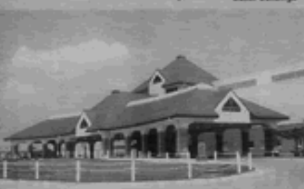
Prairie Meadows Racetrack and Casino

1435 Ohio Street P.O. Box 1315 Des Moines, IA 50305